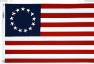
Betsy Ross Flag